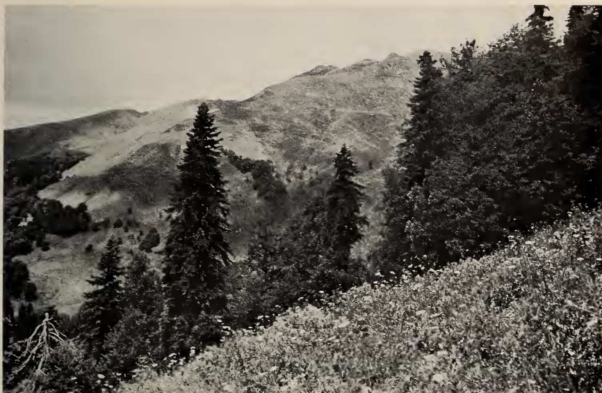
Fig. 7. Eumedonia eumedon modestus n. subsp., type locality. A meadow below upper timberline at an elevation of 1800–2000 m at Awadhara, S. W. Caucasus, surrounded by endemic fir-trees Abies nordmanniana (Stev.) Spach.

and outer appearance very similar to male. This weak sexual dimorphism may often be confusing, especially in the field. However, in some females (including allotype) upperside of hindwing bears a hardly recognizable brown spot within anal angle. Underside pattern is quite similar to that of a male.